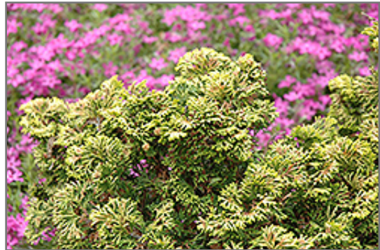
Verdon Dwarf Hinoki Falsecypress foliage

Verdon Dwarf Hinoki Falsecypress is recommended for the following landscape applications;