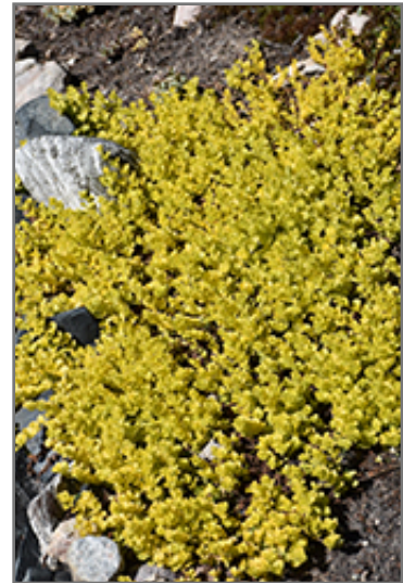
Goldilocks Creeping Jenny

Goldilocks Creeping Jenny will grow to be only 6 inches tall at maturity, with a spread of 3 feet. When grown in masses or used as a bedding plant, individual plants should be spaced approximately 24 inches apart. Its foliage tends to remain low and dense right to the ground. It grows at a fast rate, and under ideal conditions can be expected to live for approximately 10 years. As an herbaceous perennial, this plant will usually die back to the crown each winter, and will regrow from the base each spring. Be careful not to disturb the crown in late winter when it may not be readily seen!