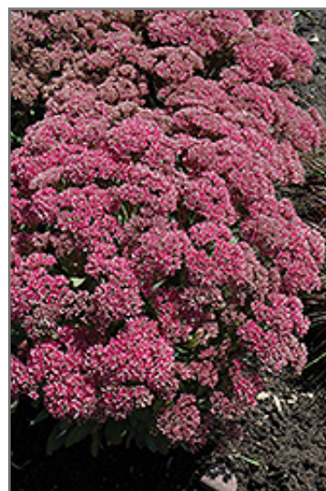
Mr. Goodbud Stonecrop flowers

This is a relatively low maintenance plant, and is best cleaned up in early spring before it resumes active growth for the season. It is a good choice for attracting bees and butterflies to your yard, but is not particularly attractive to deer who tend to leave it alone in favor of tastier treats. It has no significant negative characteristics.