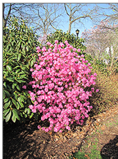
Landmark Rhododendron in bloom