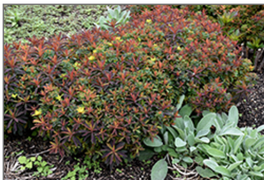
Bonfire Cushion Spurge