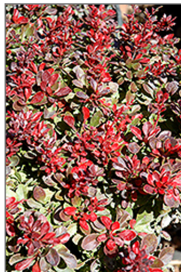
Bagatelle Japanese Barberry foliage