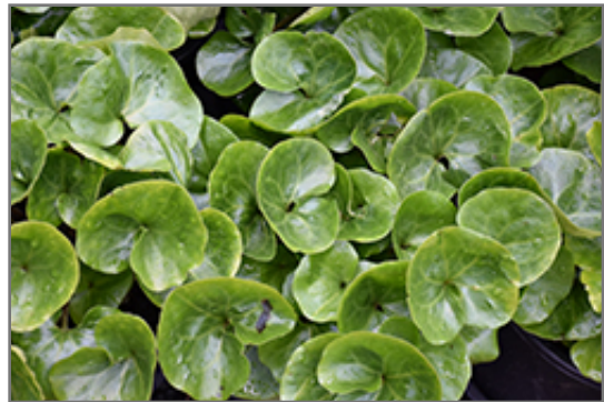
European Wild Ginger foliage