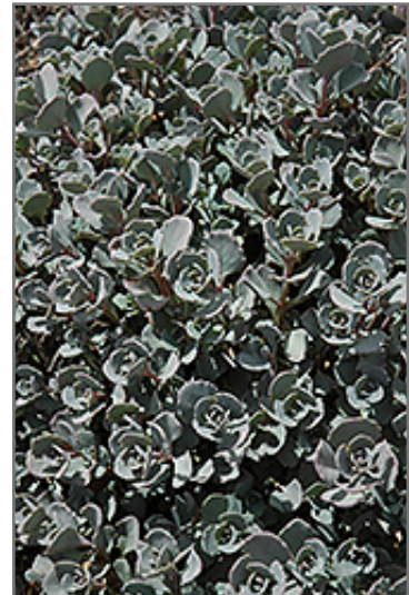
Lidakense Stonecrop foliage

Lidakense Stonecrop is recommended for the following landscape applications;