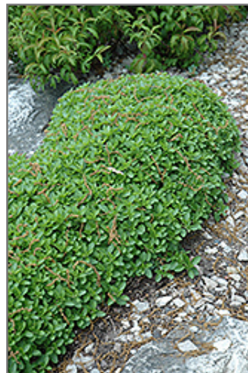
Dwarf Oregano