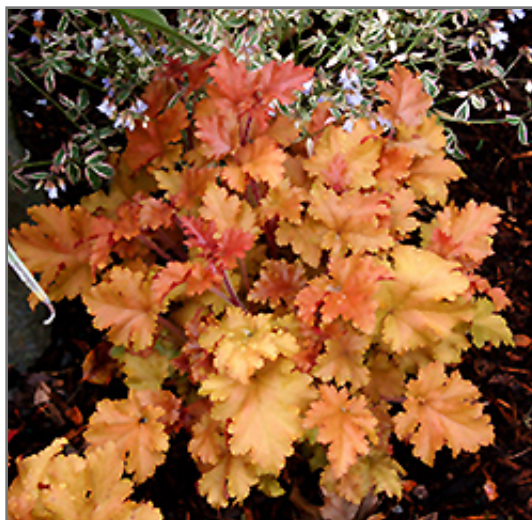
Marmalade Coral Bells foliage

Marmalade Coral Bells will grow to be about 8 inches tall at maturity extending to 18 inches tall with the flowers, with a spread of 16 inches. When grown in masses or used as a bedding plant, individual plants should be spaced approximately 14 inches apart. Its foliage tends to remain low and dense right to the ground. It grows at a medium rate, and under ideal conditions can be expected to live for approximately 10 years. As an evergreen perennial, this plant will typically keep its form and foliage year-round.