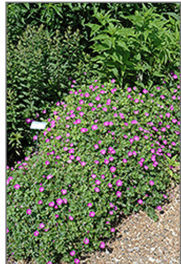
Max Frei Cranesbill in bloom