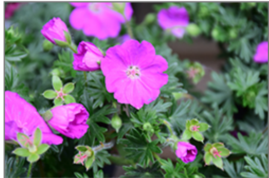
Max Frei Cranesbill flowers