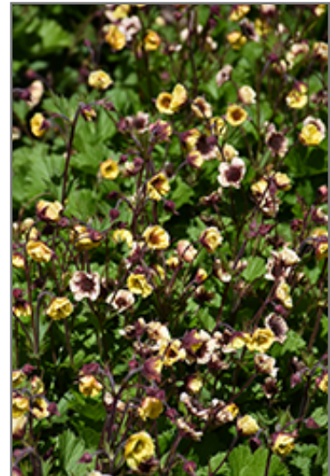
Tempo Yellow Avens flowers

This is a relatively low maintenance plant, and should be cut back in late fall in preparation for winter. It is a good choice for attracting butterflies to your yard, but is not particularly attractive to deer who tend to leave it alone in favor of tastier treats. It has no significant negative characteristics.