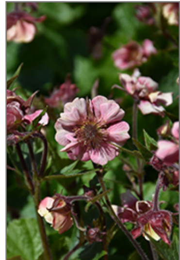
Tempo Rose Avens flowers

Tempo Rose Avens is recommended for the following landscape applications;