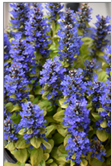
Feathered Friends Petite Parakeet Bugleweed flowers