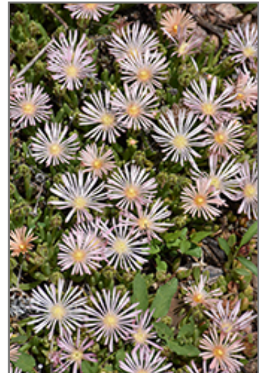
Alan's Apricot Ice Plant flowers

Alan's Apricot Ice Plant is recommended for the following landscape applications;