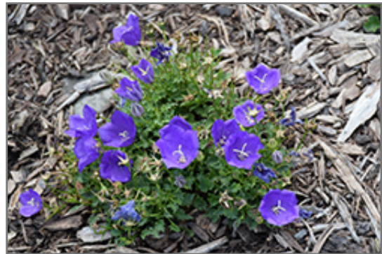
Pearl Deep Blue Bellflower in bloom