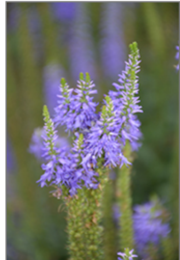
Spike Speedwell flowers

Spike Speedwell is recommended for the following landscape applications;