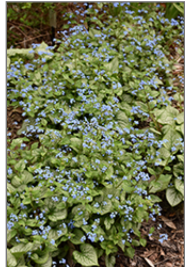
Jack Frost Bugloss in bloom

Jack Frost Bugloss will grow to be about 12 inches tall at maturity extending to 16 inches tall with the flowers, with a spread of 18 inches. When grown in masses or used as a bedding plant, individual plants should be spaced approximately 14 inches apart. It grows at a medium rate, and under ideal conditions can be expected to live for approximately 10 years. As an herbaceous perennial, this plant will usually die back to the crown each winter, and will regrow from the base each spring. Be careful not to disturb the crown in late winter when it may not be readily seen!