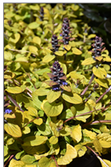
Feathered Friends Tropical Toucan Bugleweed flowers

Feathered Friends Tropical Toucan Bugleweed is a dense herbaceous evergreen perennial with a ground-hugging habit of growth. Its relatively fine texture sets it apart from other garden plants with less refined foliage.