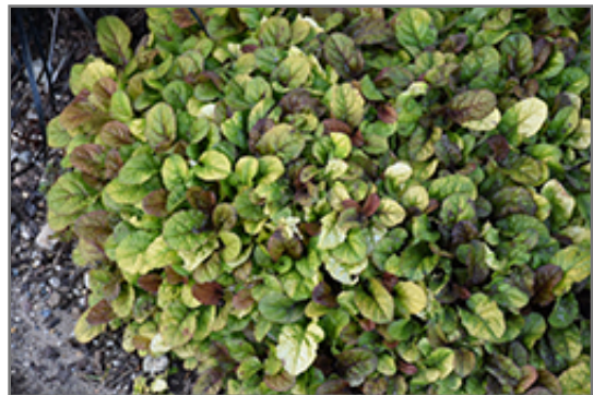
Feathered Friends Parrot Paradise Bugleweed