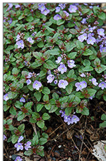
Waterperry Blue Speedwell in bloom

Waterperry Blue Speedwell is recommended for the following landscape applications;