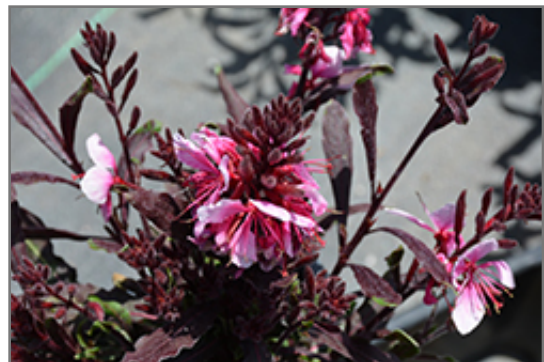
Bantam Pink Gaura flowers