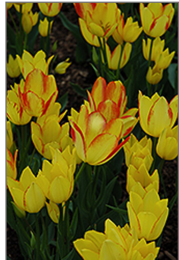
Georgette Tulip flowers