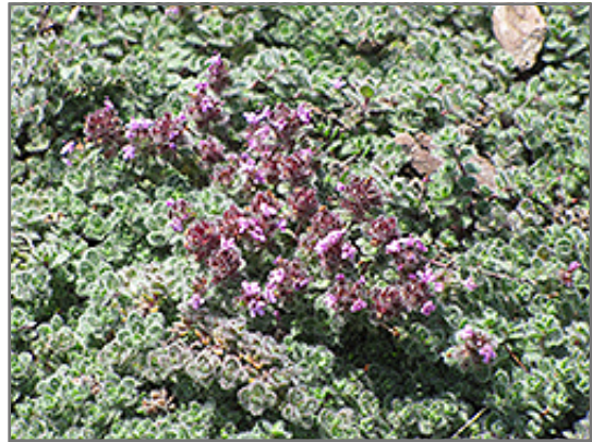
Wooly Thyme flowers

Wooly Thyme is recommended for the following landscape applications;