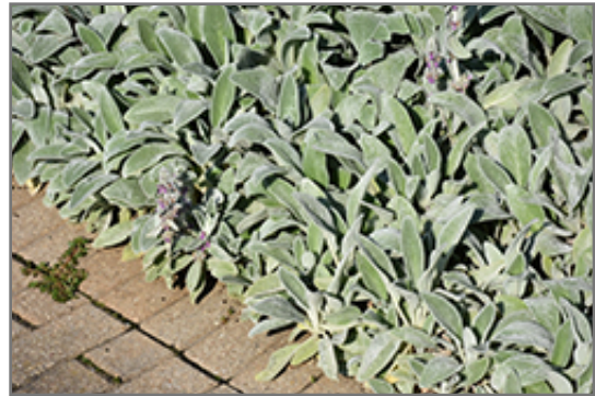
Lamb's Ears

Lamb's Ears will grow to be about 12 inches tall at maturity extending to 24 inches tall with the flowers, with a spread of 18 inches. When grown in masses or used as a bedding plant, individual plants should be spaced approximately 15 inches apart. Its foliage tends to remain dense right to the ground, not requiring facer plants in front. It grows at a fast rate, and under ideal conditions can be expected to live for approximately 10 years. As an herbaceous perennial, this plant will usually die back to the crown each winter, and will regrow from the base each spring. Be careful not to disturb the crown in late winter when it may not be readily seen!