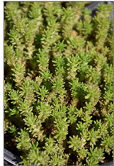
Six Row Stonecrop foliage

Six Row Stonecrop is a fine choice for the garden, but it is also a good selection for planting in outdoor pots and containers. Because of its spreading habit of growth, it is ideally suited for use as a 'spiller' in the 'spiller-thriller-filler' container combination; plant it near the edges where it can spill gracefully over the pot. Note that when growing plants in outdoor containers and baskets, they may require more frequent waterings than they would in the yard or garden.