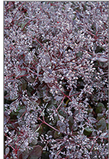
Bertram Anderson Stonecrop flowers

Bertram Anderson Stonecrop is recommended for the following landscape applications;