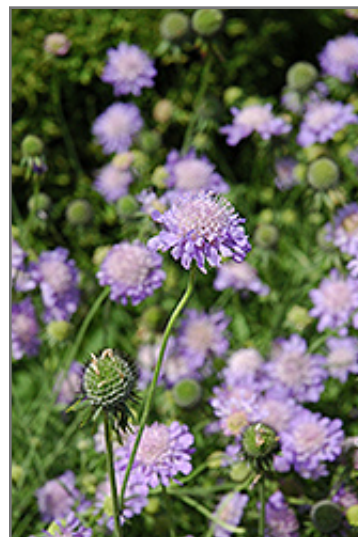
Blue Mist Pincushion Flower flowers