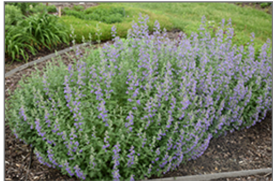
Walker's Low Catmint in bloom

Walker's Low Catmint is recommended for the following landscape applications;