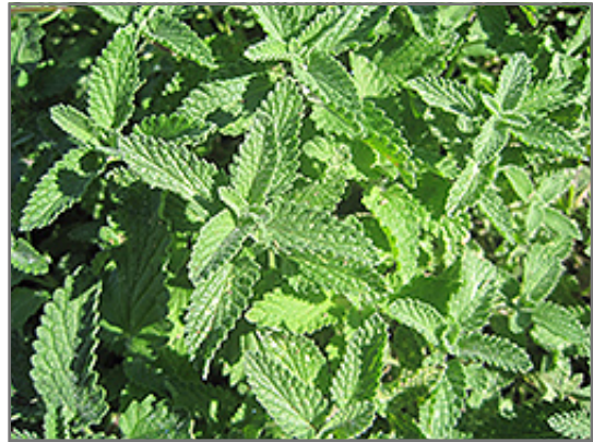
Walker's Low Catmint foliage

Walker's Low Catmint will grow to be about 12 inches tall at maturity extending to 16 inches tall with the flowers, with a spread of 12 inches. Its foliage tends to remain dense right to the ground, not requiring facer plants in front. It grows at a fast rate, and under ideal conditions can be expected to live for approximately 10 years. As an herbaceous perennial, this plant will usually die back to the crown each winter, and will regrow from the base each spring. Be careful not to disturb the crown in late winter when it may not be readily seen!