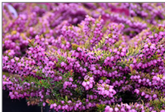
Eva Gold Heath flowers