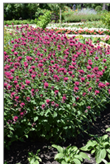
Raspberry Wine Beebalm in bloom