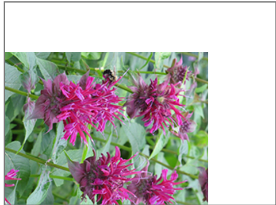
Raspberry Wine Beebalm flowers

Raspberry Wine Beebalm will grow to be about 30 inches tall at maturity, with a spread of 32 inches. When grown in masses or used as a bedding plant, individual plants should be spaced approximately 28 inches apart. It grows at a fast rate, and under ideal conditions can be expected to live for approximately 5 years. As an herbaceous perennial, this plant will usually die back to the crown each winter, and will regrow from the base each spring. Be careful not to disturb the crown in late winter when it may not be readily seen!