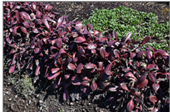
Flirt Bergenia foliage