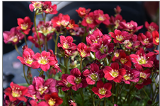
Touran Deep Red Saxifrage flowers

Touran Deep Red Saxifrage is recommended for the following landscape applications;