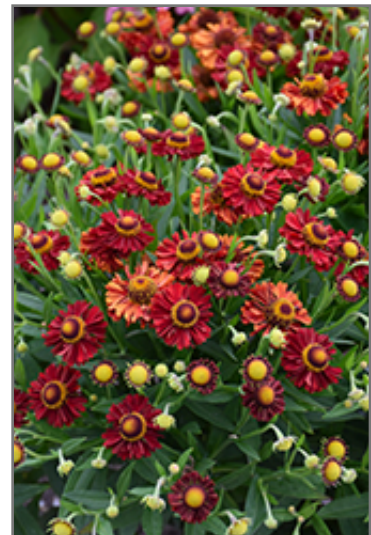
Mariachi Ranchera Sneezeweed flowers