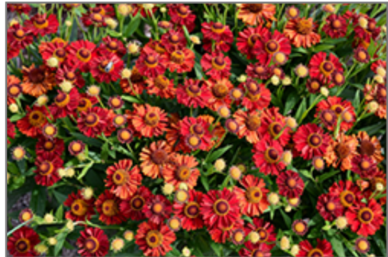
Mariachi Ranchera Sneezeweed flowers