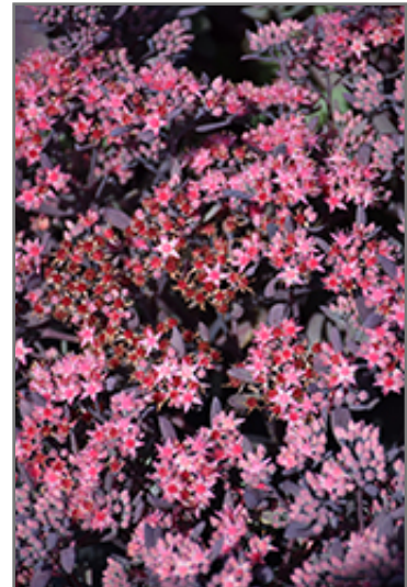
Plum Dazzled Stonecrop flowers

Plum Dazzled Stonecrop is a dense herbaceous perennial with an upright spreading habit of growth. Its medium texture blends into the garden, but can always be balanced by a couple of finer or coarser plants for an effective composition.