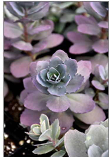
Plum Dazzled Stonecrop foliage