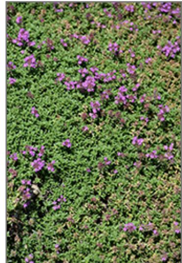
Creeping Thyme in bloom

This is a relatively low maintenance plant, and is best cleaned up in early spring before it resumes active growth for the season. Deer don't particularly care for this plant and will usually leave it alone in favor of tastier treats. It has no significant negative characteristics.