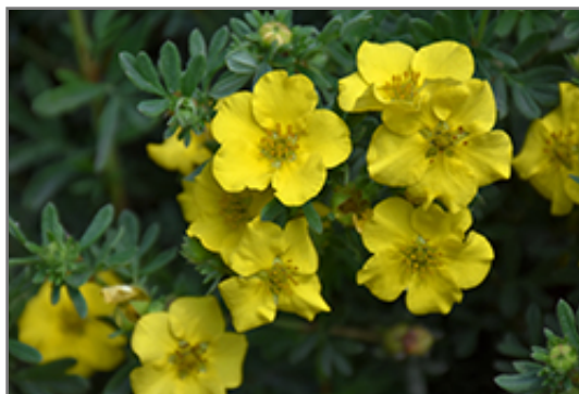
Cheesehead Potentilla flowers

Cheesehead Potentilla is recommended for the following landscape applications;