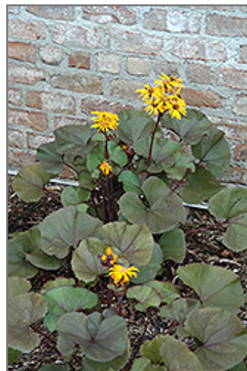
Britt Marie Crawford Rayflower in bloom