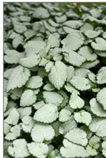
Red Nancy Spotted Dead Nettle foliage

Red Nancy Spotted Dead Nettle is a fine choice for the garden, but it is also a good selection for planting in outdoor pots and containers. Because of its spreading habit of growth, it is ideally suited for use as a 'spiller' in the 'spiller-thriller-filler' container combination; plant it near the edges where it can spill gracefully over the pot. Note that when growing plants in outdoor containers and baskets, they may require more frequent waterings than they would in the yard or garden.