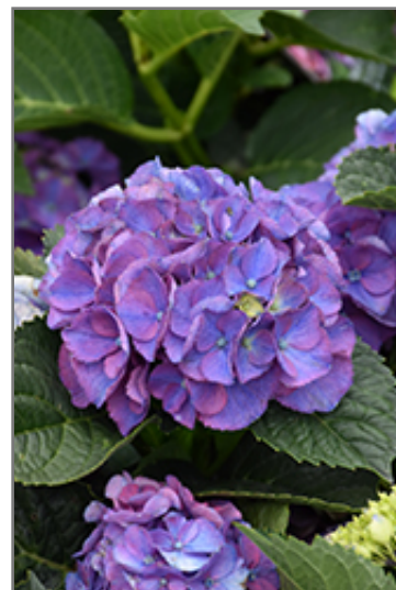
Seaside Serenade Newport Hydrangea flowers