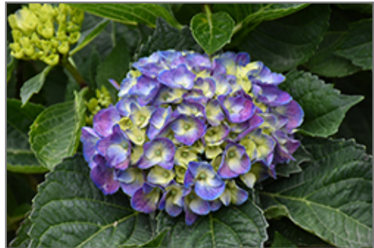
Seaside Serenade Newport Hydrangea flowers