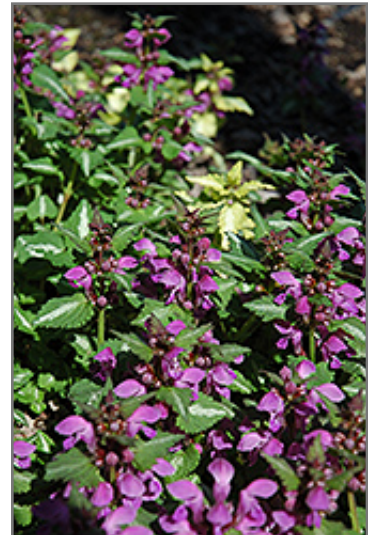
Elisabeth de Haas Spotted Dead Nettle flowers