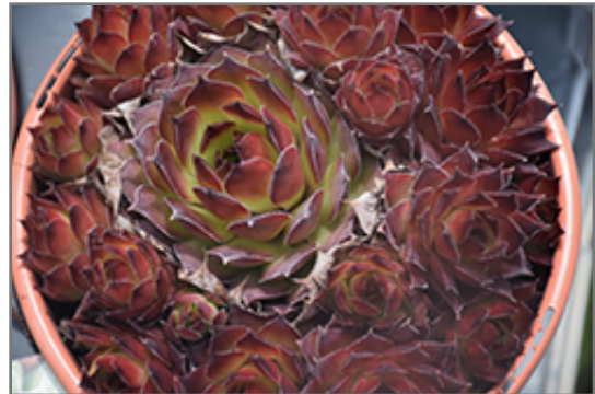
Black Hens And Chicks