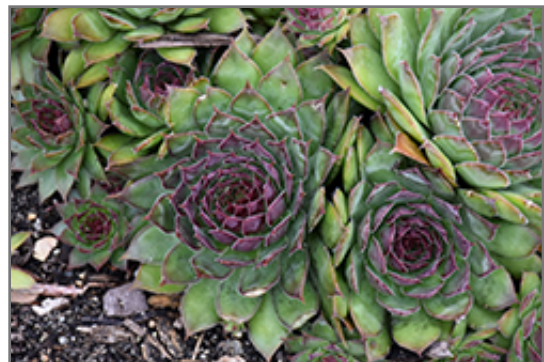
Black Hens And Chicks