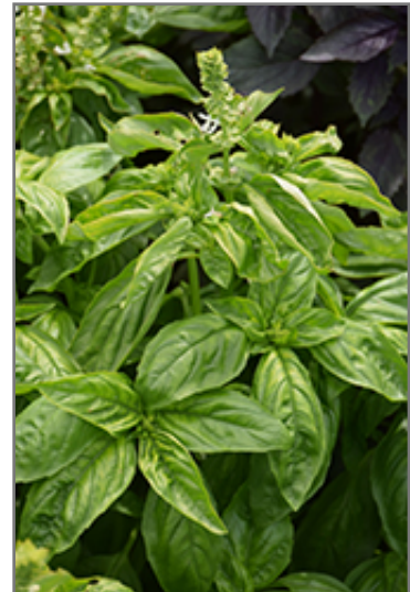
Genovese Basil foliage

Genovese Basil will grow to be about 20 inches tall at maturity, with a spread of 14 inches. When grown in masses or used as a bedding plant, individual plants should be spaced approximately 12 inches apart. This fast-growing annual will normally live for one full growing season, needing replacement the following year.