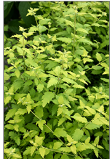
Sunshine Blue II Caryopteris foliage

* This is a 'special order' plant - contact store for details