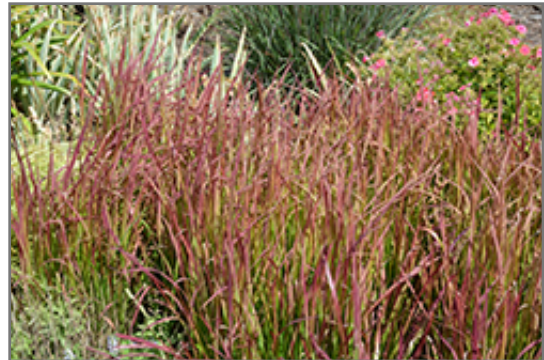
Red Baron Japanese Blood Grass

Red Baron Japanese Blood Grass will grow to be about 20 inches tall at maturity, with a spread of 18 inches. It grows at a slow rate, and under ideal conditions can be expected to live for approximately 20 years. As an herbaceous perennial, this plant will usually die back to the crown each winter, and will regrow from the base each spring. Be careful not to disturb the crown in late winter when it may not be readily seen!