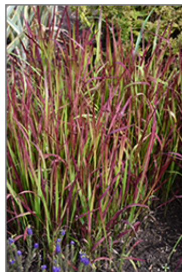
Red Baron Japanese Blood Grass foliage