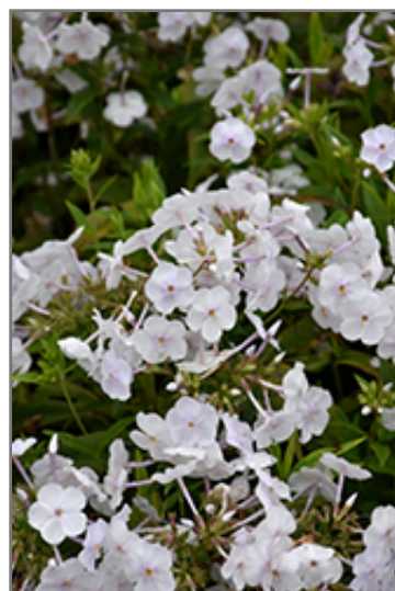
Fashionably Early Crystal Garden Phlox flowers

This plant will require occasional maintenance and upkeep, and should be cut back in late fall in preparation for winter. It is a good choice for attracting butterflies and hummingbirds to your yard. Gardeners should be aware of the following characteristic(s) that may warrant special consideration;