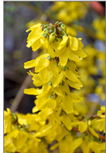
Magical Gold Forsythia flowers

* This is a 'special order' plant - contact store for details