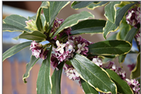
Moonlight Parfait Winter Daphne flowers

Moonlight Parfait Winter Daphne is a multi-stemmed evergreen shrub with a mounded form. Its relatively fine texture sets it apart from other landscape plants with less refined foliage.