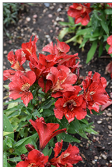
Colorita Kate Alstroemeria flowers