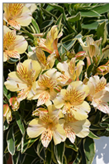
Colorita Fabiana Alstroemeria flowers

This is a relatively low maintenance plant. Trim off the flower heads after they fade and die to encourage more blooms late into the season. It is a good choice for attracting bees, butterflies and hummingbirds to your yard. It has no significant negative characteristics.